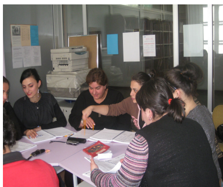
TKT Training, Tbilisi

We invite YOU as well as any other English Teacher, member or non-member, to participate in ETAG accredited training courses. Just a reminder that we offer the best training programmes, highly qualified trainers, international standards trainings, a British Council-ETAG joint certificate (in case of TKT) and most importantly, a true way to career development.