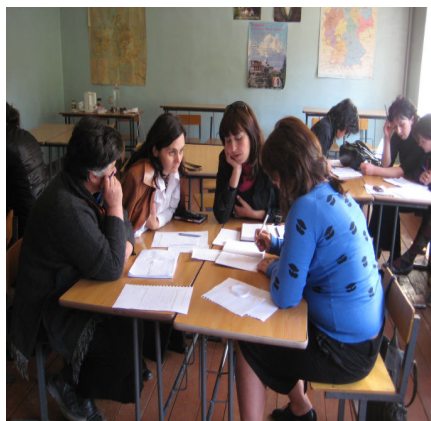
DWS Training, Mestia

September and October turned to be extremely busy for us. Under the state programme of English teachers' professional development, the accredited training courses have been successfully completed in Tbilisi, Kutaisi, Rustavi, Zugdidi, Chiatura and Mestia. More are being conducted or planned to be conducted in Tbilisi, Kutaisi, Telavi, Batumi, Keda, Poti, Zugdidi, Abasha, Gori, Kvareli, Sachkhere and Kaspi. We are especially proud of the trainings conducted in such faraway regions as Svaneti and Zemo Adjara. In these parts of our country there are limited opportunities for professional development so we are happy to contribute to this. In the picture you see a team of teachers attending the Developing Writing Skills training in Mestia.